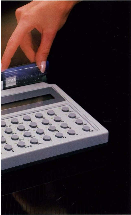
Integra introduces SofTerm — 3rd generation high performance transaction processing.